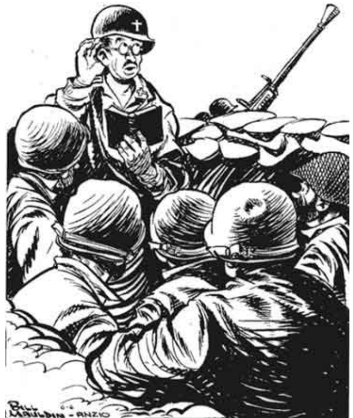
BILL MAULDIN - ANZIO