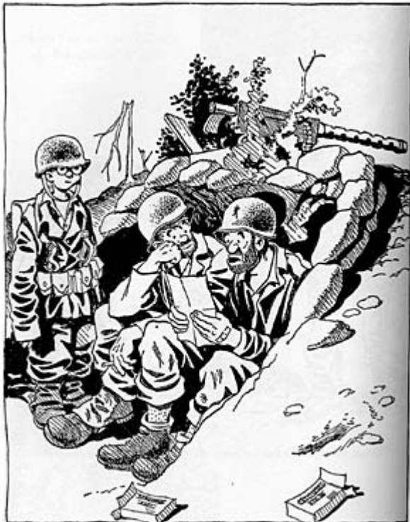
BILL MAULDIN'S ARMY